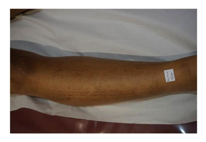
Figure 1(c): Right leg pretreatment photography. The white spots near knees were previous test with the Q-switched Nd:YAG picosecond domain lasers before start treatment.