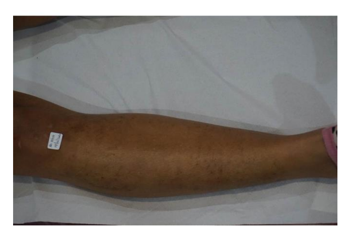
Figure 1(d): After 5 sessions Q-switched Nd:YAG picosecond domain lasers it obtained a complete reduction of the pigmented lesion.

Pain during treatment was well-tolerated with the cold air supply only. No side effects or complications were noted. After 1 year of follow up since the last treatment session in June 2019, no relapse of the NS was observed. The patient rated the results as excellent, exceeding expectations she had before starting the treatment.